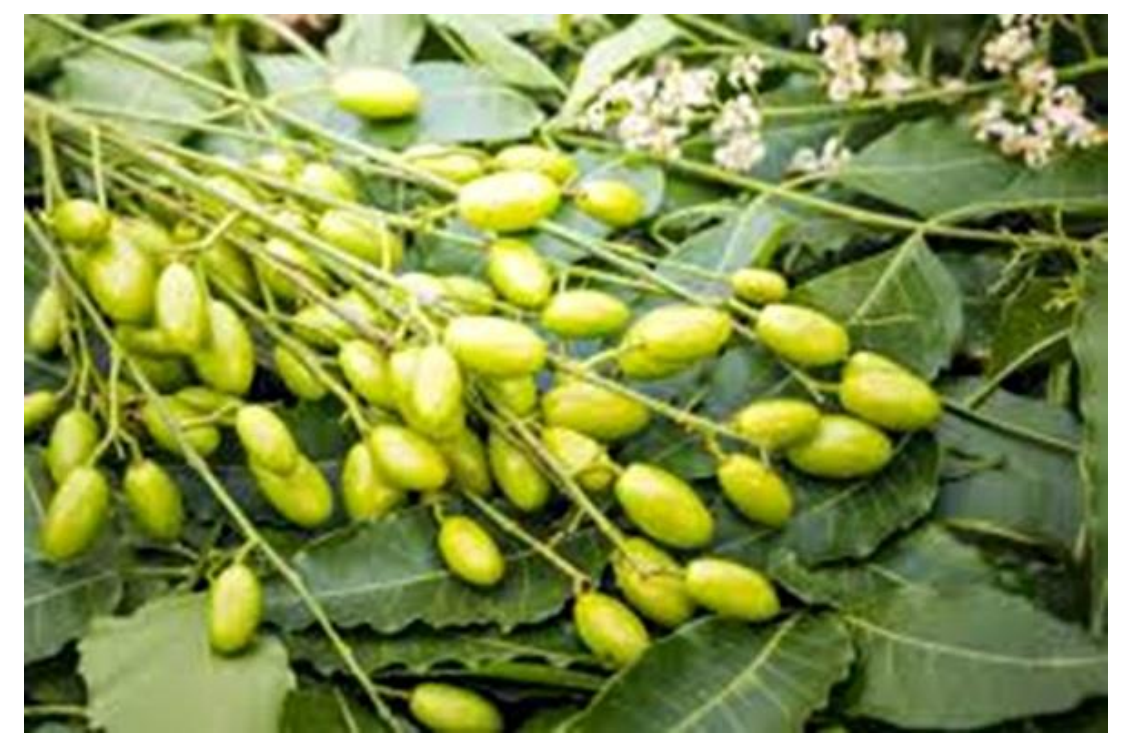
Plate: Azadirachta indica Fruits

also on riverine Habitat. It has no occurrence over the tops of sand dunes as well as on hills top surface.