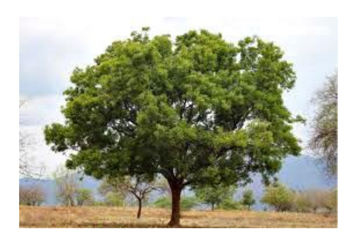
Plate: Azadirachta indica Tree

It has 'poly-climax' distribution in nature, or in other words to say the may be observed in more than one Habitat i.e. sandy plains Habitat, gravel formations, stony and rocky Habitat and